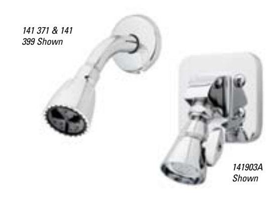
Showerheads are available in four models: deluxe chrome-plated brass, standard chrome-plated brass, adjustable massage, and economizer chrome-plated ABS. Arm and flange options include standard and deluxe chrome plated brass.