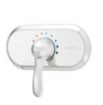
Deluxe chrome-plated brass faceplate and handle provide lasting performance and an attractive appearance.