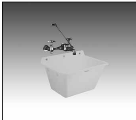
Shown with optional 63.600A Mop Service Faucet